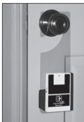
Hang on door inside room

Note: CA-DX may be registered with a CA-360, CA-360H or CA-RX remote receiver).